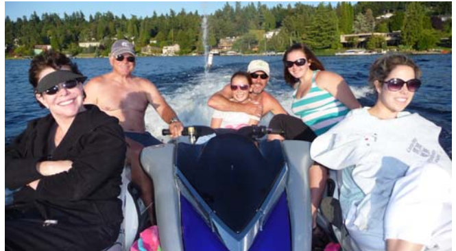
Dykstra Family Cruise

In addition to Mt. Rainier, Puget Sound and the Space Needle, a dramatic uniqueness of the Seattle area is its Billionaire Row. The row covers 12 miles of LW’s eastside waterfront with Microsoft billionaires at each end and in the middle. Paul Allen lives at the south end on Mercer Island, Steve Ballmer lives at the northeast end in Hunts Point and Bill Gates lives in the middle in Medina. Based on Forbes’ 2009 list of “The 400 Richest Americans,” all of Washington state’s richest of the rich live here. A cruise-tour of the row makes this a unique and memorable boating destination.